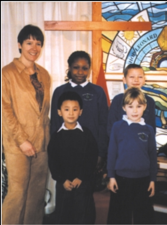
Caroline Spelman MP visits Bishops Wilson Primary School, Chelmsley Wood, which scored highly in its latest report from Ofsted.

THE PAST YEAR has seen a number of local schools visit the Houses of Parliament or receive visits from local MP, Caroline Spelman.